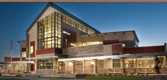
Gulf Gate Library, Sarasota County