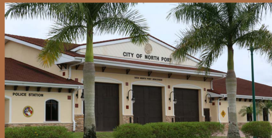
North Port Police Substation, City of North Port