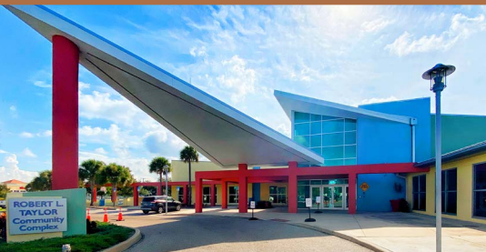
Robert L. Taylor Community Complex, City of Sarasota

Learn more about past and future projects at sarasotacountysurtax.net .