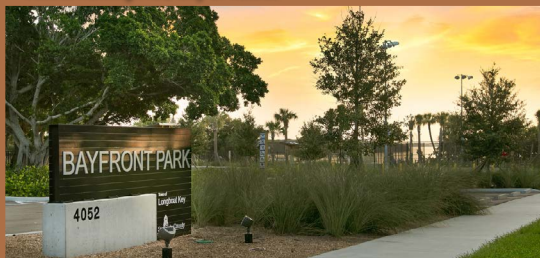
Bayfront Park, Town of Longboat Key