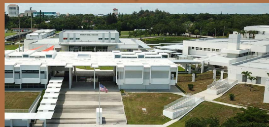
Sarasota High School, Sarasota County School District